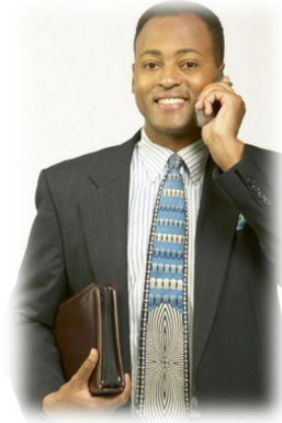
How good are you at Selecting Talent?

Continued on page two – Talent Selection