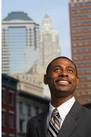
Do You Lead an Optimistic Lifestyle?

Continued on page two – Shared Leadership